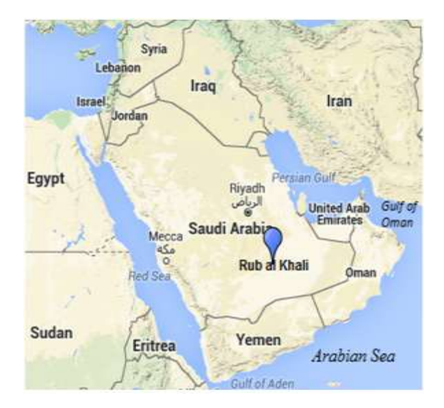
Fig.4. Rub al Khali or Empty Quarter region and water sources nearby Arabian Peninsula

Algae grow much faster than other crops and produce a larger amount of oil per unit area than conventional crops such as jatropha, coconut, palm etc; also the harvesting cycle of algae is limited to a short period of 1 to 10 days. It can be grown on lands inappropriate for food crops and other oil crops. The factors that don't support the development of agriculture are not the limiting factors of algae farming.