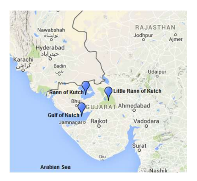
Fig.3. Map showing the locations of Gulf of Kutch, Rann of Kutch, and Little Rann of Kutch

Boundaries to the northeast, east, southeast, south, west, and north of the Arabian Desert are the Persian Gulf, Gulf of Oman, Arabian Sea, Gulf of Aden, Red Sea, and Syrian Desert. Since water resources surround the above-mentioned countries, those places are suitable for algae farming. Rub al Khali or Empty Quarter, which is the largest sand desert, is a portion of the Arabian Peninsula stretching over Yemen, Oman, United Arab Emirates (UAE), and Saudi Arabia. Location of Rub al Khali is shown in Fig. 4. Although there are rich oil sources, algae cultivation also has to be taken seriously because we cannot rely on fossils for a long period.