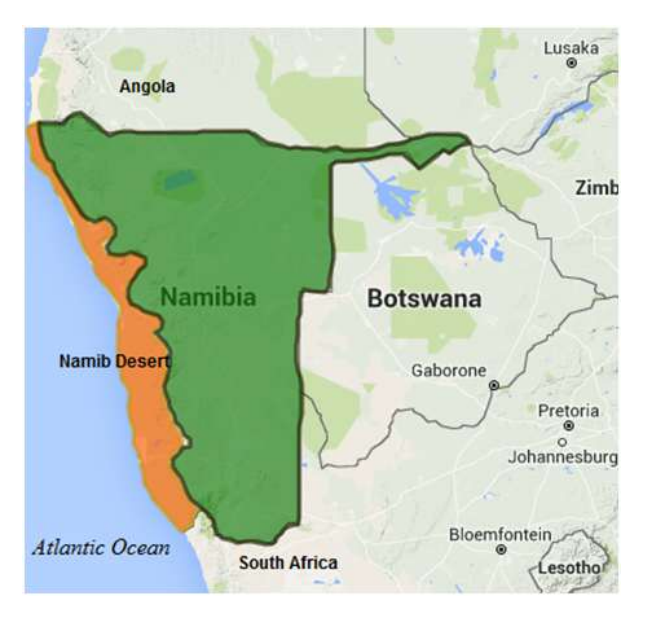
Fig.5. Location of the Namib Desert in Southern African region

Alga can make use of infertile land and wastewater for its growth. It takes nutrients and uses toxic gasses for augmentation and thereby recycles the wastewater and purifies the atmosphere. So it is good to cultivate alga nearby power plants or industrial factories. Any time of year is suitable for the cultivation of algae. Alga has the capability to be grown in regions away from the farmlands and forests. Thus, it minimizes the damages to the ecosystem and food chain supply. However the present algal yields are not sufficient to meet the modern transportation and heating requirements.